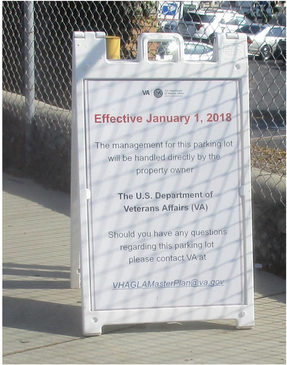
JUDICIAL WATCH -- Federal Audit Exposes Corruption in Illegal VA Land Sharing Agreements at LA Facility https://www.judicialwatch.org/blog/2018/10/fed-audit-exposes-corruption-in-illegal-va-land-sharing-agreements-at-la-facility/