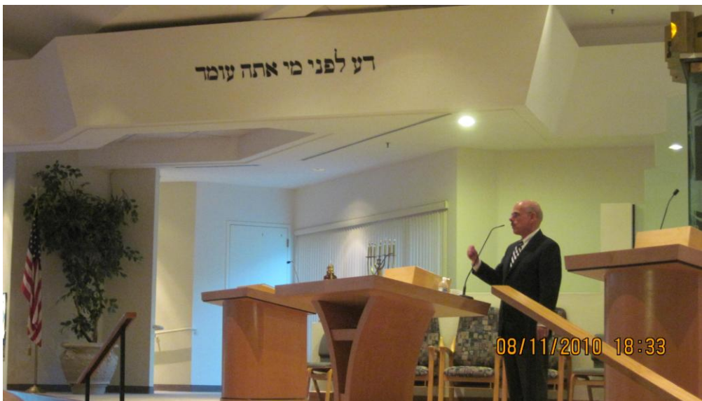
Congressman Waxman speaking before a Town Hall meeting at the Shomrei Torah Synagogue in his 30 th District.

On August 11, Congressman Waxman held a Town Hall meeting and was asked what he thought about Arizona's immigration law SB 1070. He responded that it was “mean spirited,” and the audience booed.