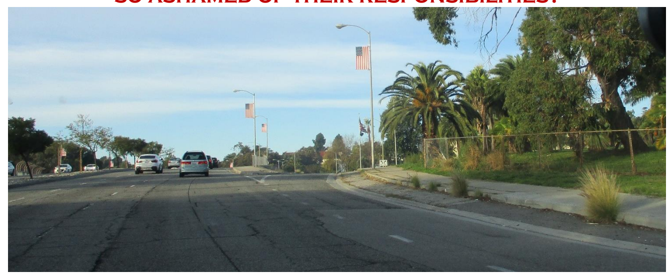
WILSHIRE EAST-BOUND ENTRANCE TO THE LOS ANGELES VA .... ABSOLUTELY NO SIGNAGE WHATSOEVER. WHY IS THE VA SO ASHAMED OF THEIR RESPONSIBILITIES?